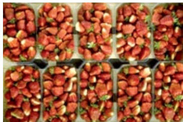
■ Careful packaging Class II