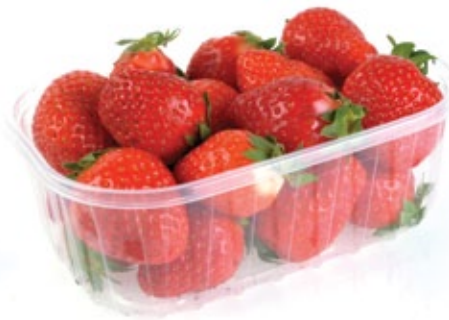
■ Careful packaging in plastic