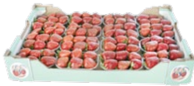
■ Careful packaging Class Extra