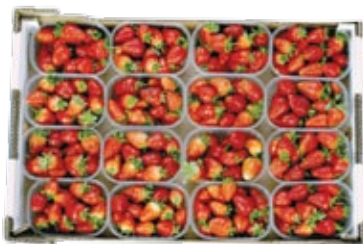
■ Careful packaging Class I